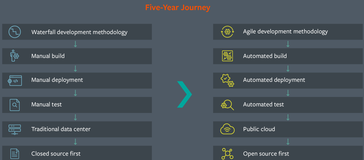
Figure 4. Five-year reengineering journey

The transformation involves completely reengineering the company's IT operating model over a five-year period. Figure 4 shows the changes that the reengineering will bring.